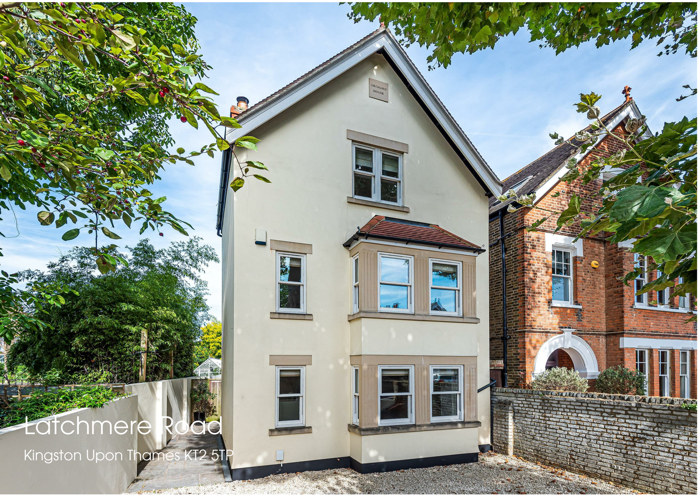
Latchmere Road Kingston Upon Thames KT2 5TP

34 Richmond Road Kingston upon Thames Surrey KT2 5ED www.gibsonlane.co.uk Tel: 020 8546 5444